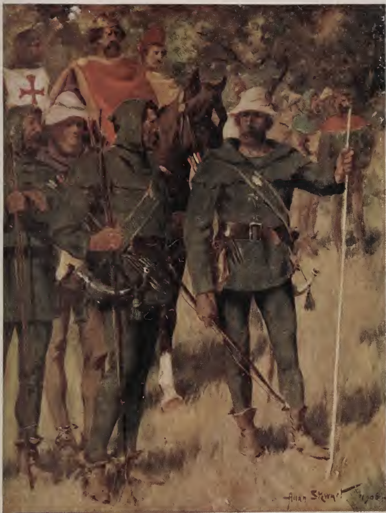
FOUR WERE CLAD IN LINCOLN GREEN.